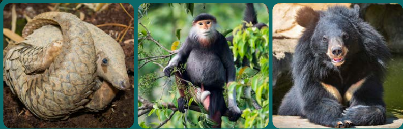
The Sunda Pangolin, Red-shanked Douc, and Asiatic Bear are just some of the threatened species found in WLT's Carbon Balanced projects

All of World Land Trust's forest protection and restoration projects have measurable, long-term local community benefits, a positive climate impact and significant biodiversity conservation value.